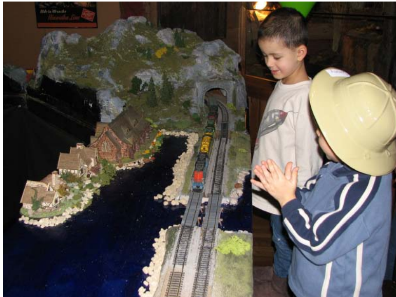
Worth The Wait For The Trains To Emerge From The Tunnel At The Popular Train Show