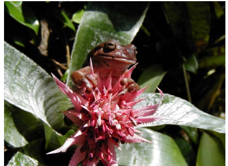
White's Tree Frog In Our Greenhouse

Bird Jungle California Pizza Kitchen Cassano's Pizza Trattoria Chef Central Dangerfield's Comedy Night Club Dog Charm Studio Elite Island Resort Fountain Diner & Restaurant Fun Craft Galerie St. Etienne Global Gatherings Hammond Museum & Stroll Garden Jacob Burns Film Center