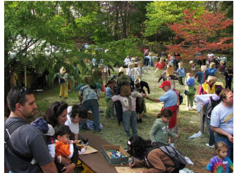
Building Scarecrows At The Fall Festival