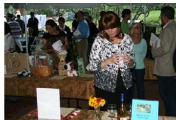
Visitors survey the silent auction offerings